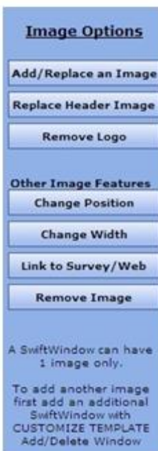
Image Options: perform these functions from the image options screen:

Refresh Template: displays the most current version of the template.